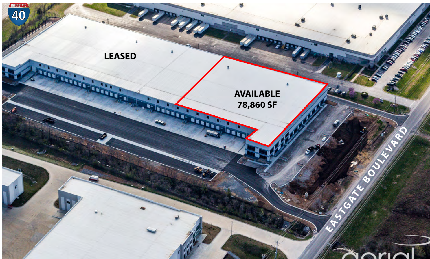
Aerial date: March 10, 2023